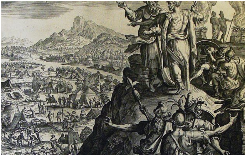
A print from the Phillip Medhurst Collection of Bible illustrations showing Balaam blessing the Jews as Balak looks on.

talking donkey, Balaam blesses the Hebrews with the famous epitaph “How goodly are thy tents, O Jacob.”