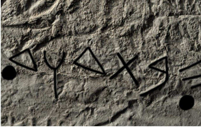
Digital drawing of the proposed reading, end of line 31 of the Mesha Stele inscription.