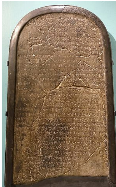
A plaster replica of the Mesha Stele found in Chicago's Oriental Institute. The basalt 9th century BCE original is found in the Louvre.

Due to the wear on the stone, a break down the middle, and lack of pieces, only a few of the Moabite letters are clear enough for confirmation and could arguably be read as — a bet , a gap, and then a waw and a daled .