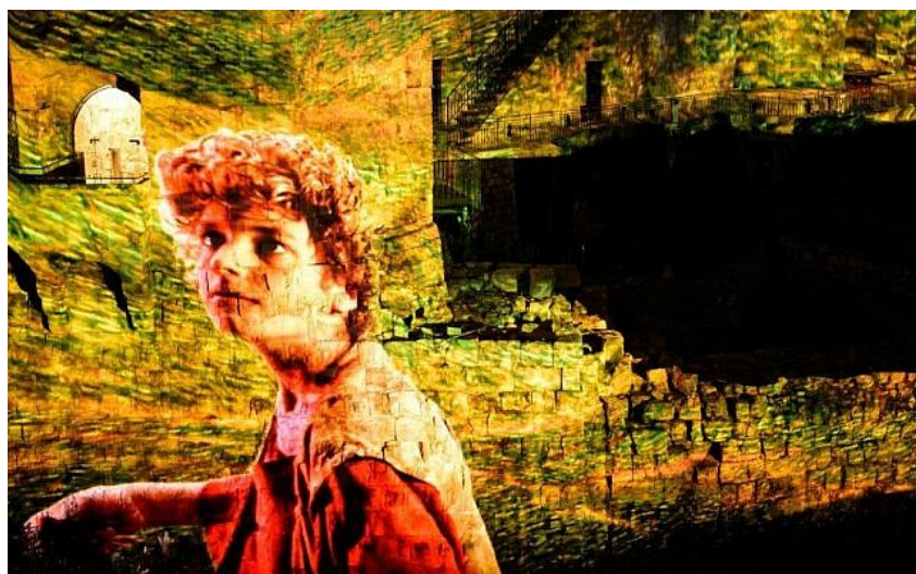
Detail from a scene depicting a young David in new Tower of David King David Night Experience, March 2018

Rather than the missing letters spelling out the end of Beit and the beginning of the word David , the scholars say the waw letter previously assumed to be the middle letter of “ David ” is actually the start of a new word.